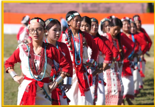
A glimpse of College Day Celebrations, 2025