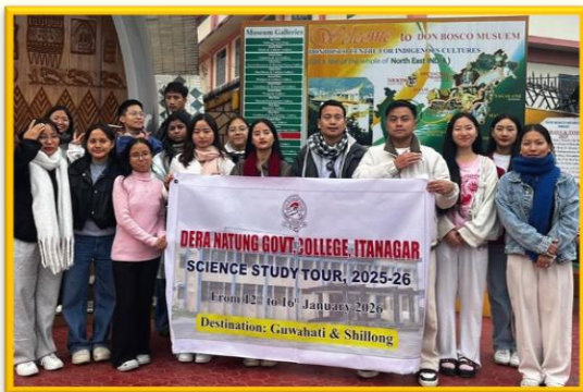
Students at Shillong during Science Excursion, 2025-26