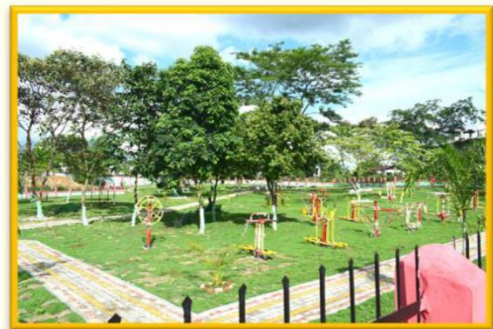
Open Gym-Cum Park