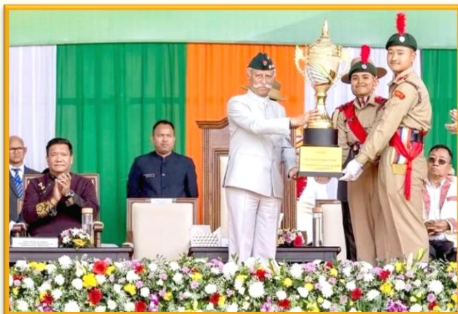
The Hon'ble Governor presented the award for the Best Parade Contingent to NCC unit of DNGCI during the Republic Day Celebrations, 2026