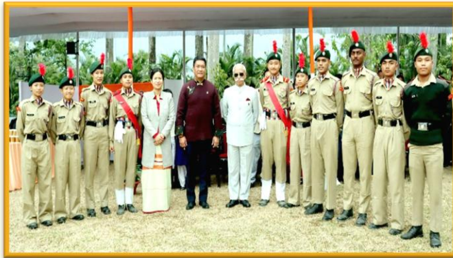
The Hon'ble Governor and the Hon'ble Chief Minister interacted with CTO and cadets of NCC unit of DNGCI during the "At Home" function at Lok Bhawan, Itanagar on 26 th January, 2026