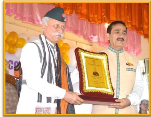
The Hon'ble Governor being presented memento by Principal, DNGCI on Foundation Day and Felicitation cum Induction Programme Celebrations, 2025