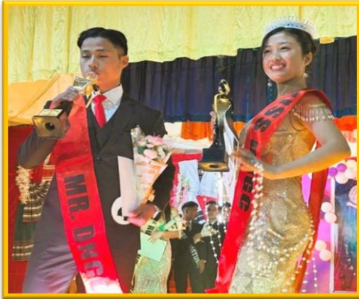
Mr. and Miss DNGC, 2025