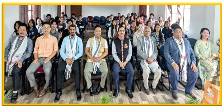
Workshop on AI, cyber security and forensics organized by DNGCI in collaboration with Rashtriya Raksha University (RRU), Pasighat, 2026