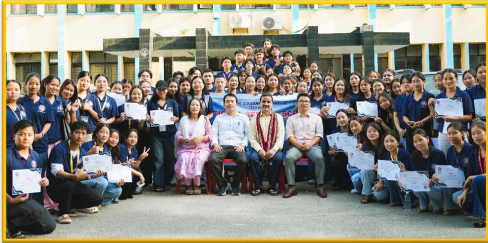
DNGCI Hosts Career Counselling and NSS Certificate Distribution Program