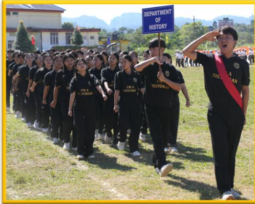
Best Parade Contingent-2025, Dept. of History