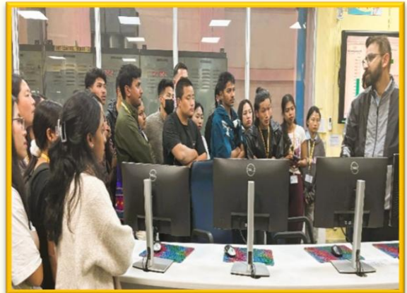
Students of the Geography Dept. during a study tour to NEEPCO, Hoj, 2025