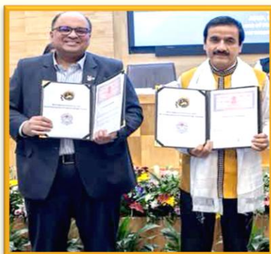
Entrepreneurship Development Cell of DNGCI signed a MoU with Arunachal Pradesh Innovation and Investment Park, Govt. of Arunachal Pradesh, 2025