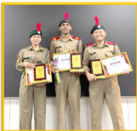
Three NCC cadets from the DNGC unit were awarded the Best cadets of the state of Arunachal Pradesh, 2025