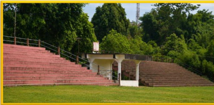
Gallery and Parking Lot