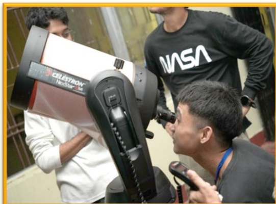
A student of the Physics department during the star-gazing programme, 2025