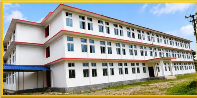
Newly constructed Boys' Hostel