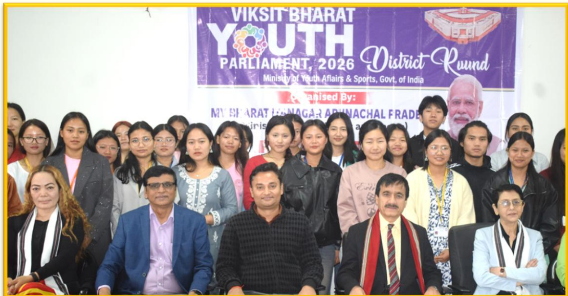
District level of Vikshit Bharat Youth Parliament, 2026, held at DNGCI under the aegis of My Bharat Itanagar