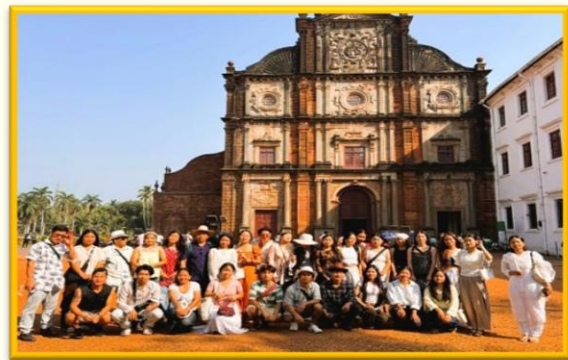
Students at Goa during General Excursion, 2025-26