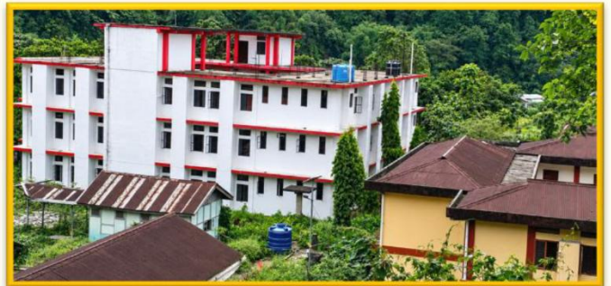
Newly constructed Girls' Hostel