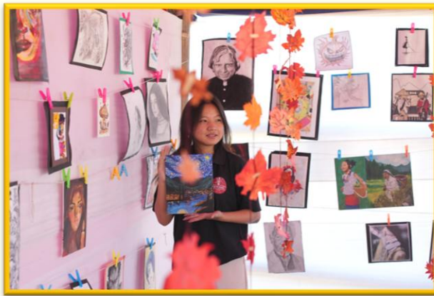
A member of the Arts Club proudly presents her artwork during College Week Celebration, 2025