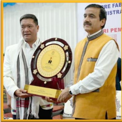
Principal, DNGCI, presenting memento to the Hon'ble Chief Minister, 2026