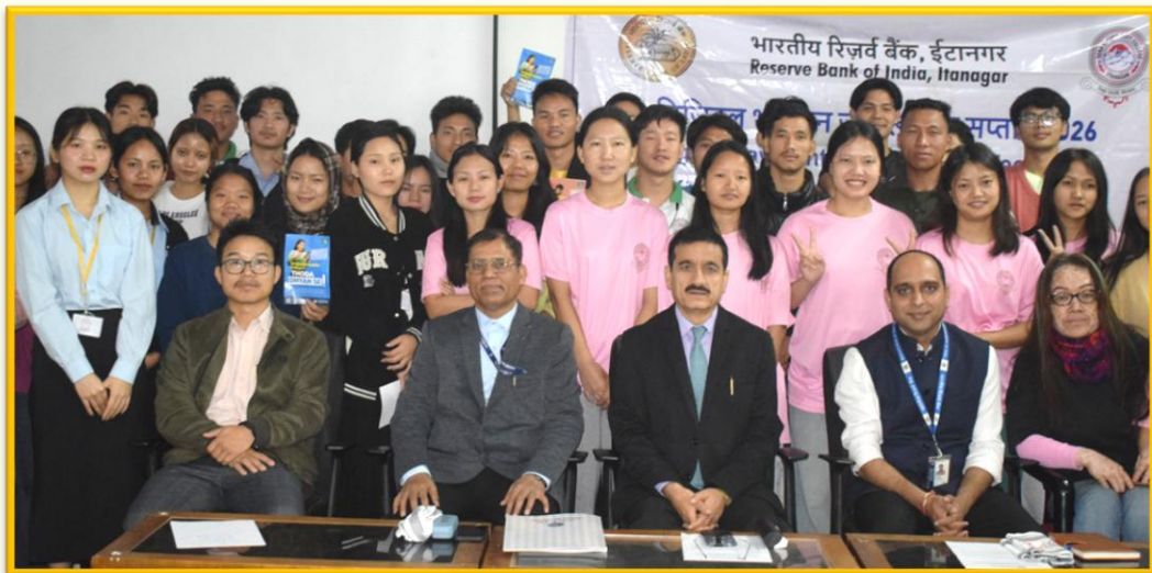
DNGC, Itanagar, in collaboration with RBI Itanagar Sub-Office, organized a Digital Payments Awareness Week 2026 programme