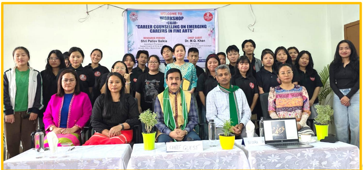
Workshop-cum-Career Counselling on emerging Careers in Fine Arts, 2025