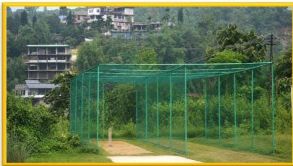
Cricket Practice Pitch