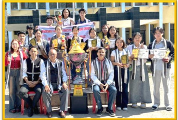
DNGC with ICYF Champion Trophy, 2025