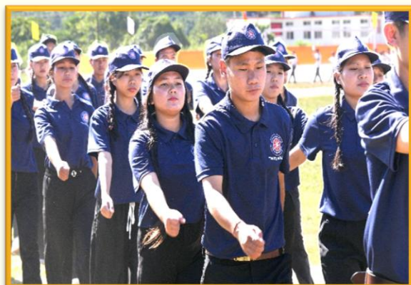
NSS Cadets marching towards Service and Nation Building